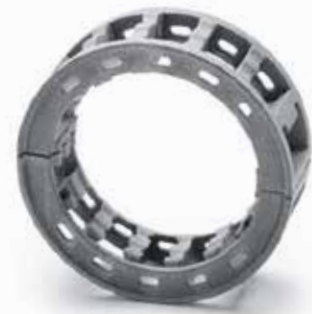
Data courtesy of Bowman - Additive Production