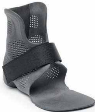
Data courtesy of OT4 Orthopädietechnik GmbH