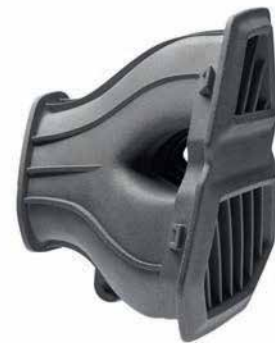
Printed with HP 3D High Reusability PP enabled by BASF