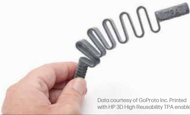
Data courtesy of GoProto Inc. Printed with HP 3D High Reusability TPA enabled by Evonik