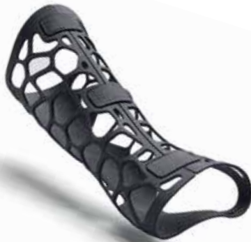
Data courtesy of Invent Medical