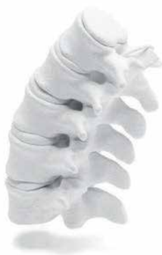
Data courtesy of Addit-ion