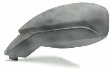
Data courtesy of Skorpion Engineering Srl