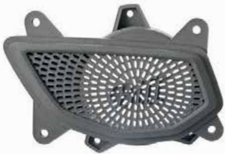
Printed with HP 3D High Reusability PP enabled by BASF