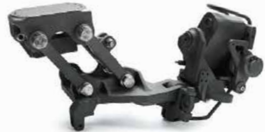
Data courtesy of Prometal3D